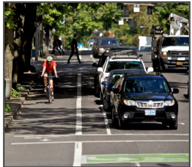
Parking protected bike lane near Portland State University